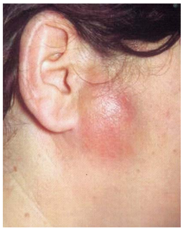
Fig. I Photograph of a patient with parotid abscess prior to treatment.

All patients had computed tomography (CT) of the parotid gland except for one patient who presented with an abscess that had burst spontaneously. The continuity of this patient's abscess through the parotid fascia into the parotid substance was confirmed at surgical exploration. CT showed ringed macroscopic pus collections within the substance of the parotid gland, with pus extending through the parotid fascia to point into the overlying subcutaneous tissues (Fig. 2). None of the patients had evidence of duct stones or duct dilatation on CT or radiographs, and there was no pus coming from the opening of the parotid duct in the mouth on clinical examination. In nine patients, the abscess was limited to the superficial parotid lobe but in one patient, the pus was located principally in the deep part of the gland.