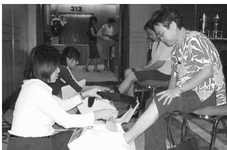
A participant having her bone density measured by a staff from Merck Sharp & Dome (MSD) during the free health screening exercise.

to discuss with their doctors which screening tests are appropriate for them. He stressed the need for an economic balance between the cost of screening, diagnosing and treating patients, and the estimated expenditure on medical care if the disease was not diagnosed early through screening. He also urged doctors to be mindful of these guidelines when advising their patients on health screening.