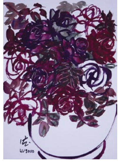
Dark Red Roses in a White Vase (2000)