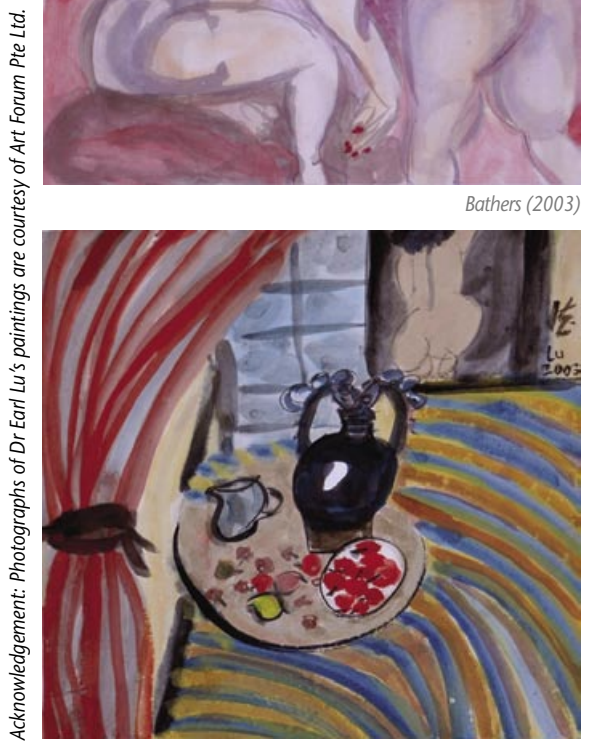
Still Life (2002)