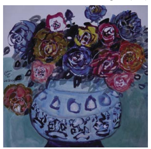
Wealth and Abundance (2004)