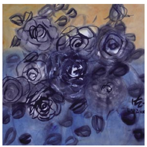
Ink Roses with Blue and Yellow Background (2004)