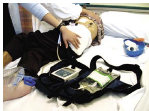
A lady with intractable pain from a pathological fracture of the right neck of femur from advanced cancer of colon. She had severe drowsiness from high doses of morphine, severe chest infection and impending death from sepsis, yet pain was poorly relieved. An implanted intrathecal device conferred pain relief, and she cleared her chest infection as she began to sit up. She lived on for nine months, and sat on a wheelchair and travelled on a MRT for her monthly reviews. She remained pain-free even up to her last moments.