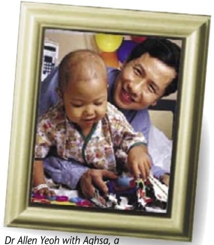
Malay patient with relapsed leukaemia, cured by bone marrow transplant.