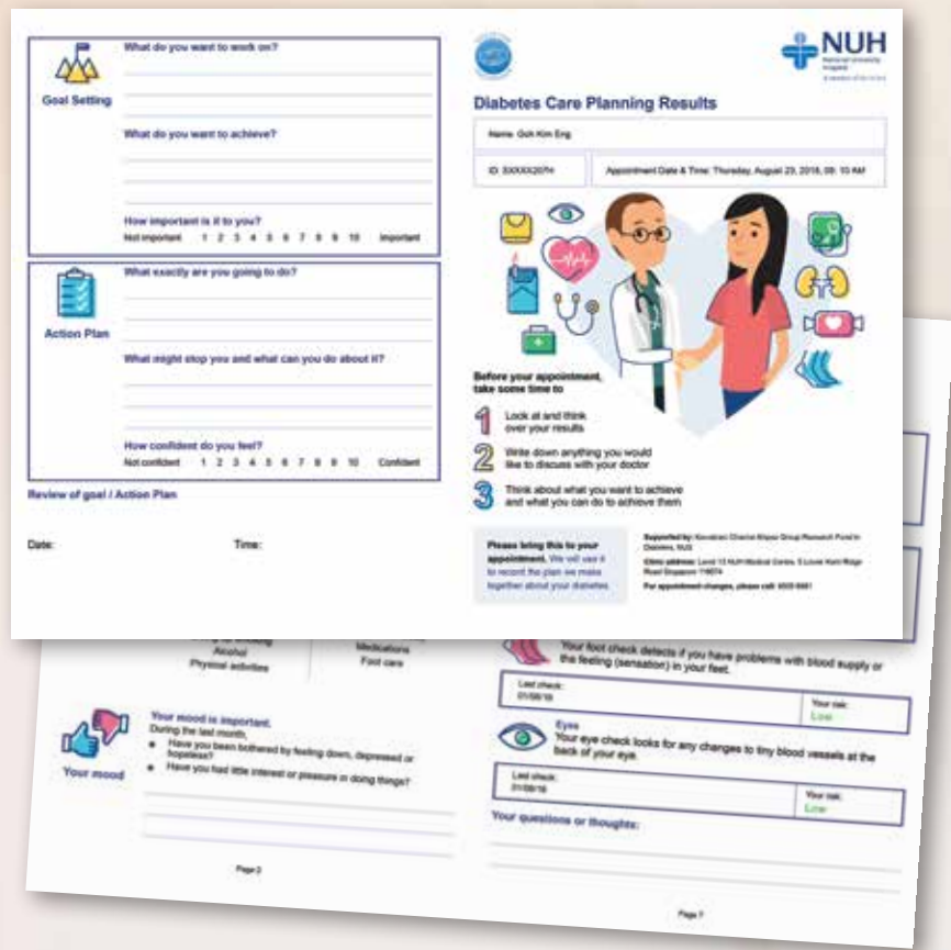
Figure 2. Pages from the NUH YoC Results Letter presenting results, explanations and goal-setting prompts

In October 2017, the pilot YoC Singapore programme was launched at the NUH diabetes clinic. Two clinical coordinators were hired for the programme and patients were recruited. In January 2018, the first CSP conversation was held. To date,