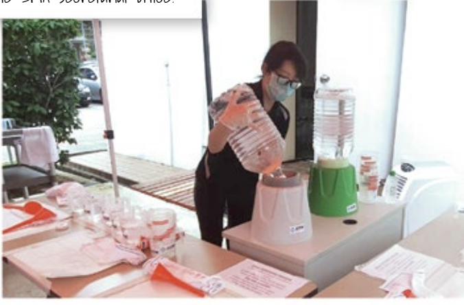
Topping up hand sanitiser for dispensing