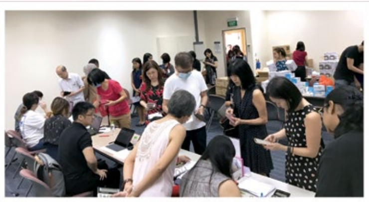
The large crowd of HCWs purchasing masks