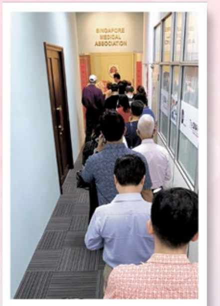
The queue extended all the way outside the SMA secretariat office!

SMA played its part in the growing COVID-19 crisis in its own way! To help front line healthcare workers, SMA procured N95 and surgical masks for sale to Members to ensure they are sufficiently equipped to handle any potential cases. A few weeks later, in collaboration with the Temasek Foundation, SMA was mobilised again to assist with dispensing hand sanitiser for registered medical/dental clinics as well as SMA Members.