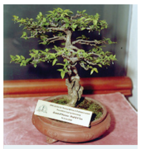
Bonsai presented at the foundation laying ceremony of the SMA CMEP

6 Formation of the SMA Centre for Medical Ethics and Professionalism (SMA CMEP)