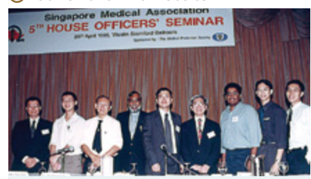
SMA 5th House Officers' Seminar