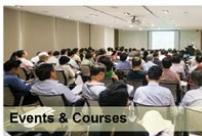
Events & Courses

Receive complimentary or subsidised rates as an SMA Member