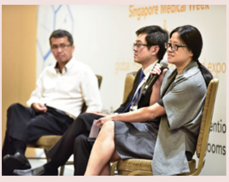
I Mandarin public symposium speakers addressing participants' concerns