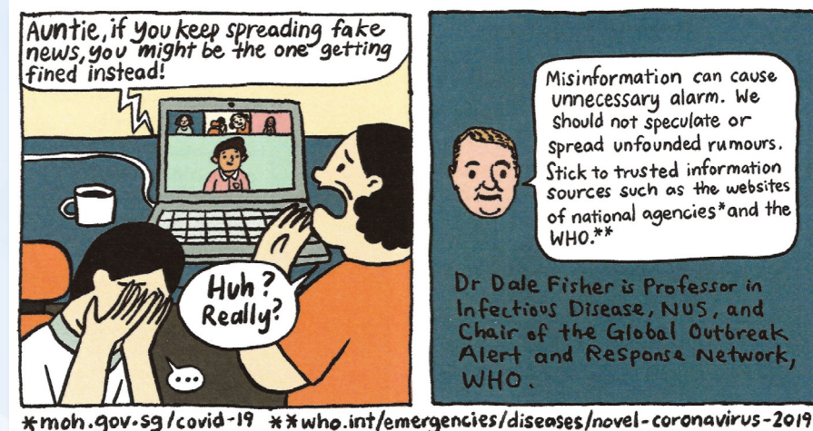
Chronicles 33 Don't Spread False Information crop

The book also aims to counteract all the misinformation that muddles social media and reinforces scaremongers and anti-vaxxers. "Misinformation can