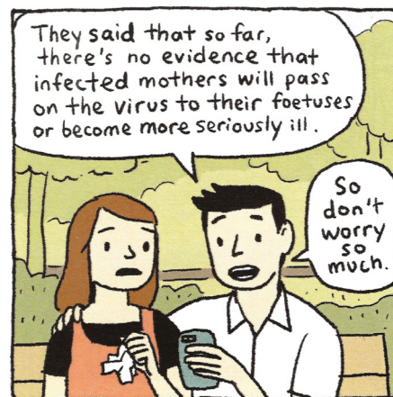
Chronicles 18 Mommies Don't Worry crop