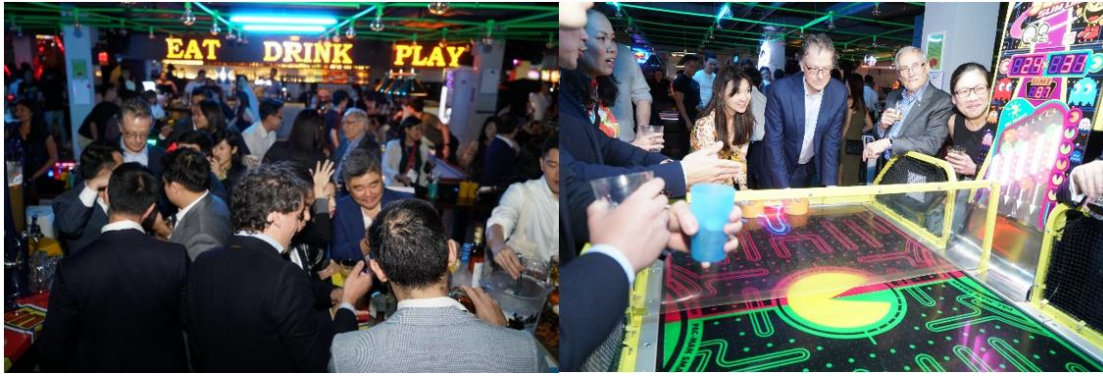
Caption: The global YO events concluded on a high with the global YOs and their mentors enjoying a night of fun, laughter and games.