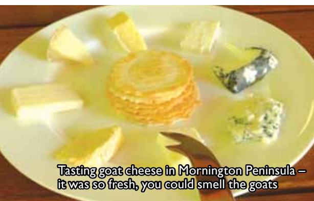
Tasting goat cheese in Mornington Peninsula – it was so fresh, you could smell the goats