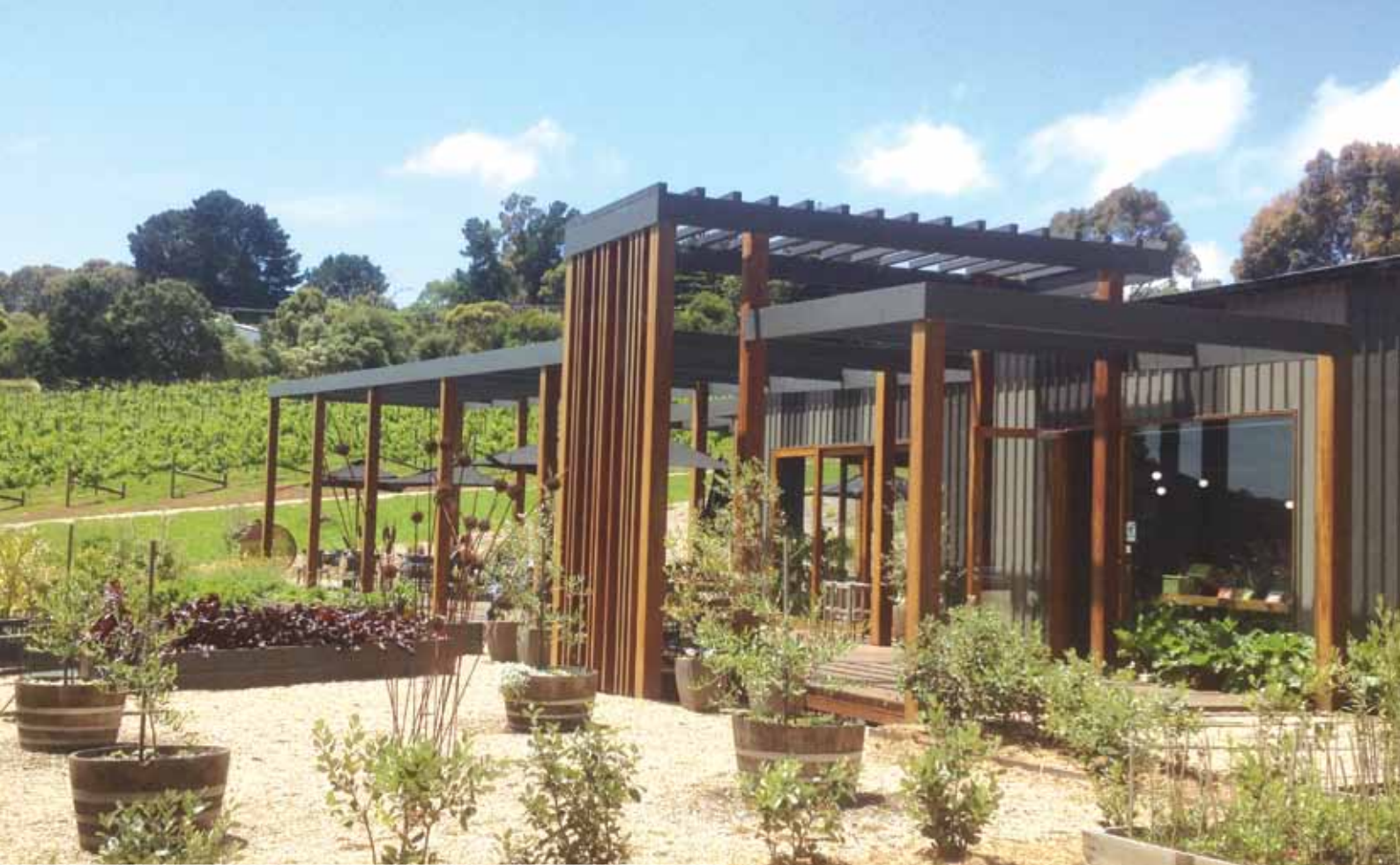
Green Olive at Red Hill Vineyard and Olive Grove