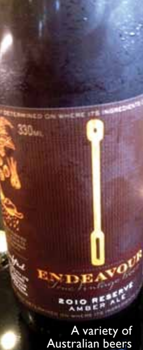
A variety of Australian beers