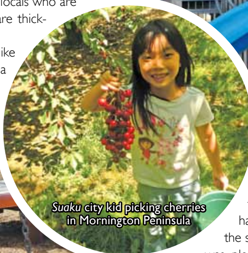
Suaku city kid picking cherries in Mornington Peninsula