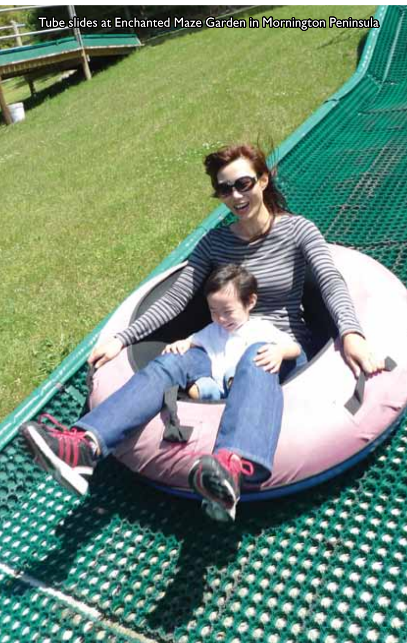
Tube slides at Enchanted Maze Garden in Mornington Peninsula