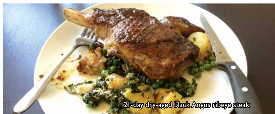
21-day dry-aged black Angus ribeye steak