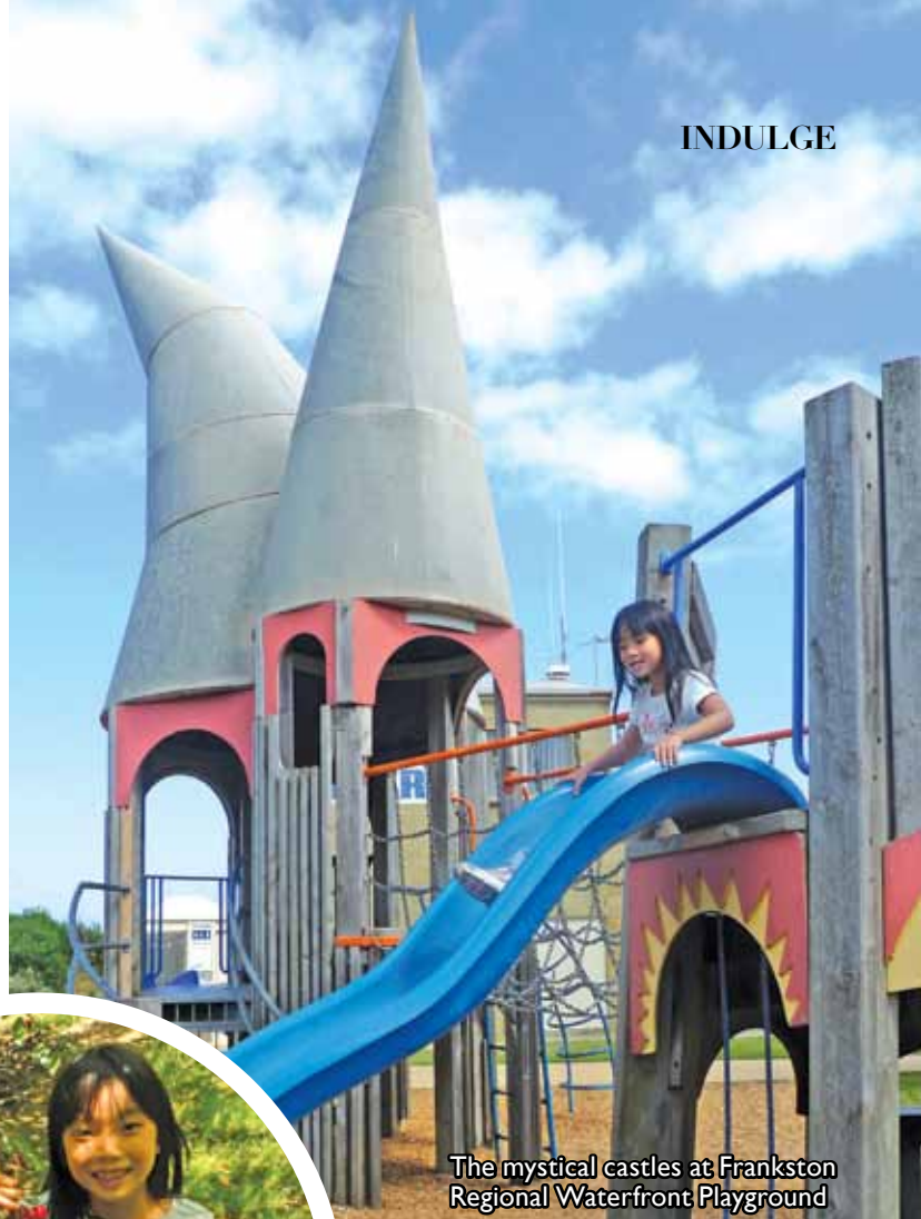
The mystical castles at Frankston Regional Waterfront Playground

There are two forts built to look like mystical castles (at least to the kids), a pirate ship, swings, a flying fox, monkey bars and a sandpit, which is surrounded