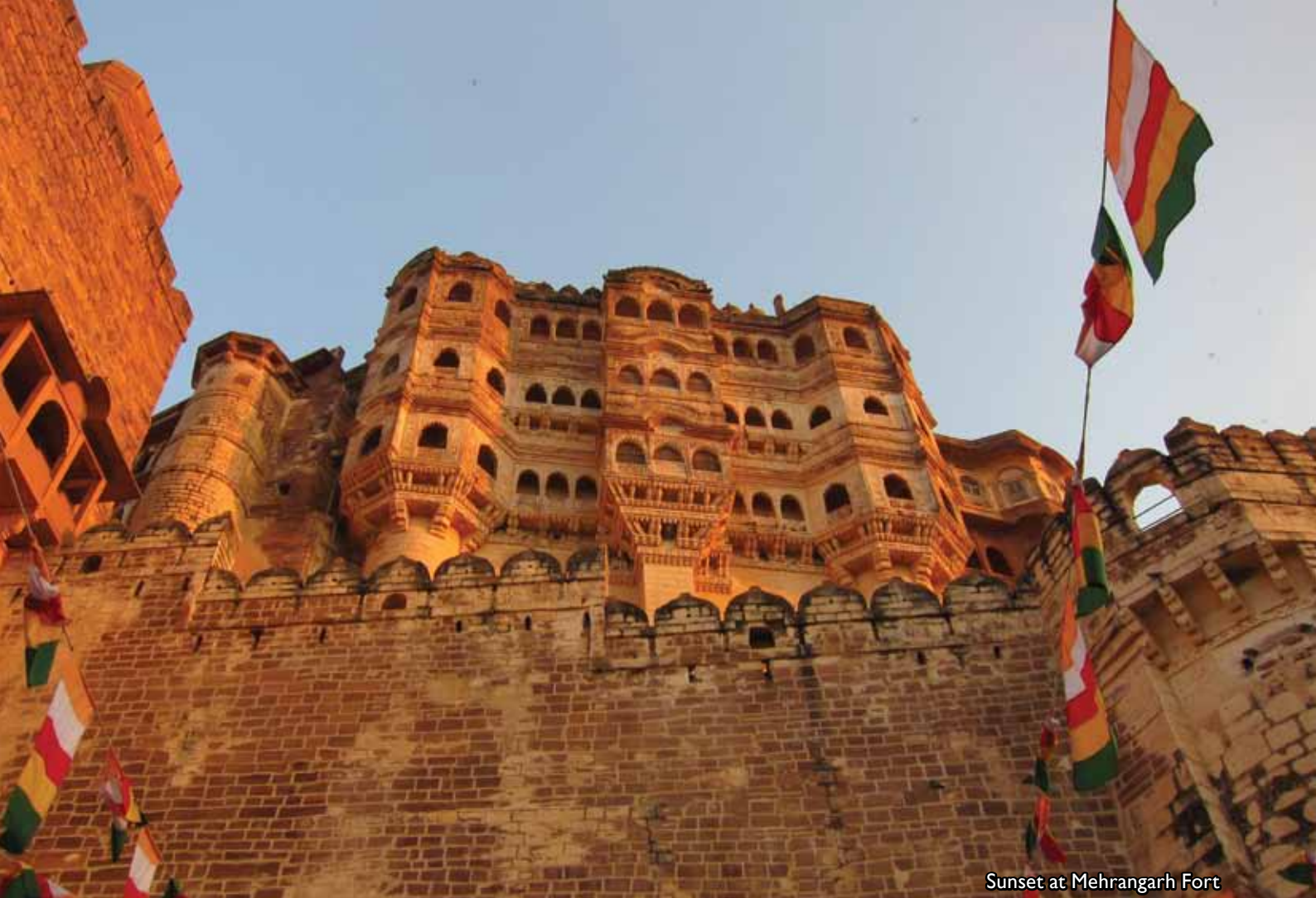
Sunset at Mehrangarh Fort