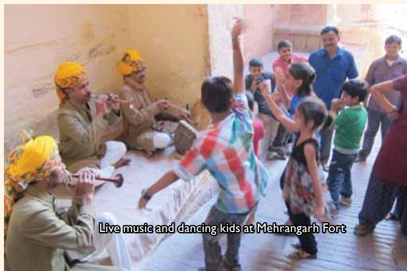
Live music and dancing kids at Mehrangarh Fort