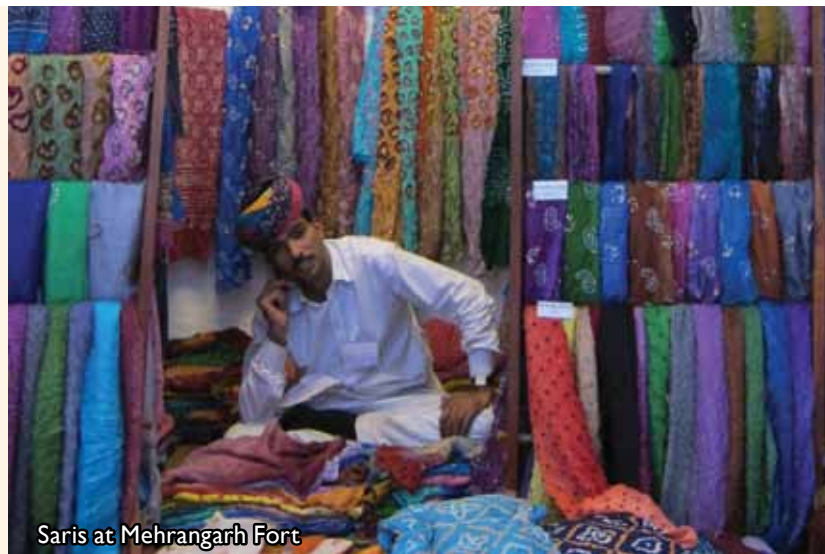
Saris at Mehrangarh Fort

However the most memorable and enjoyable part of the trip was the flying fox zip-line tour ( http://www.flyingfox.asia/cmspage.aspx?pgid=53 ) of the fort at sunrise. Those who know me are familiar with my significant fear of heights, but this just proves that on holiday we do take some (calculated) risks... The tour was an hour plus-long trek and zip around part of this UNESCO Heritage Award site, with the longest zip-line measuring 300 metres over the lake. It was an exhilarating start to the day and we thereafter still managed to hop onto a Jet Airways flight to New Delhi just in time for afternoon tea at the Taj Mahal Hotel. SMA