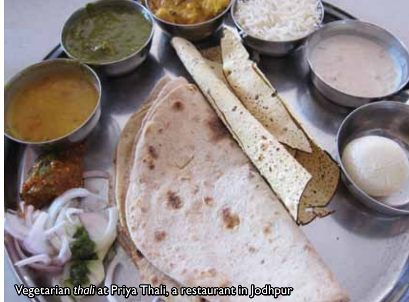
Vegetarian thali at Priya Thali, a restaurant in Jodhpur