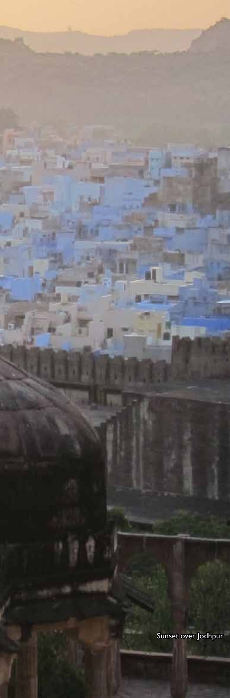
Sunset over Jodhpur