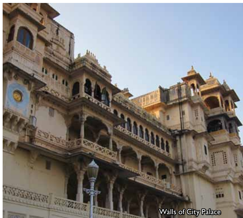
Walls of City Palace