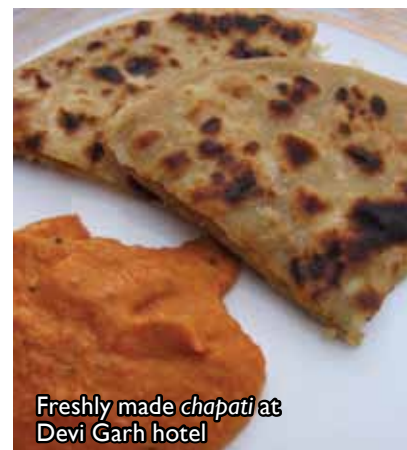
Freshly made chapati at Devi Garh hotel

on being one of the most well-stocked in Rajasthan with arms, armour, costumes and paintings on display. Trivia: part of the Batman movie The Dark Knight Rises was filmed in the fort.