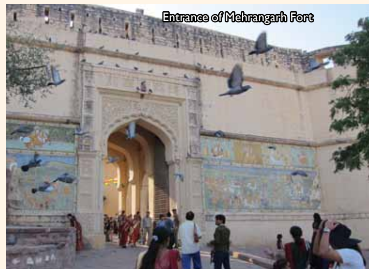
Entrance of Mehrangarh Fort

From Udaipur, we took an Air India flight to Jodhpur and stayed at the Raas, a small boutique hotel in the shadow of the Mehrangarh Fort (a giri durg , which means "hill or mountain fortress"). The formidable edifice is situated more than 120 metres above the city. It consists of various palaces and period rooms. Most impressive was the fort's Mehrangarh Museum, which prides itself