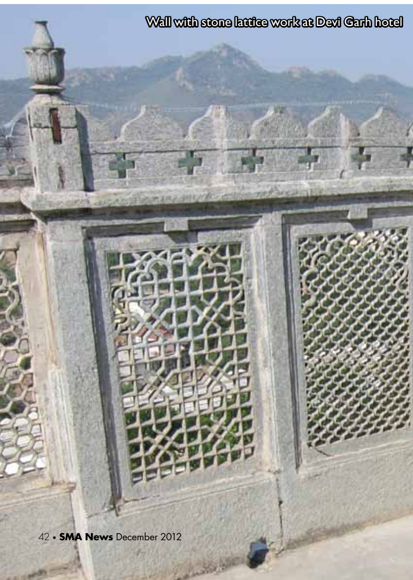
Wall with stone lattice work at Devi Garh hotel

After a quick lunch in a restaurant on the shores of Lake Pichola, overlooking the Lake Palace (we decided to give it a miss), we proceeded to the City Palace. The City Palace was the seat of the Mewar maharanas. It was successively built and enlarged over 70 generations, and is a rich blend of Rajasthani, Mughal, medieval, European and even Chinese styles of architecture. It was bustling with local tourists as it was a weekend, which added to the festive atmosphere.