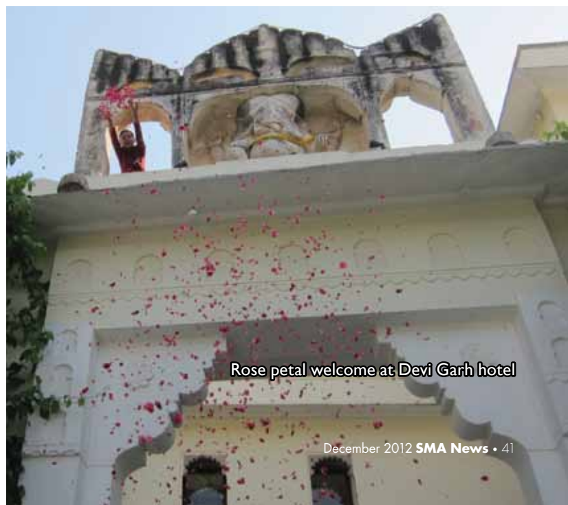
Rose petal welcome at Devi Garh hotel