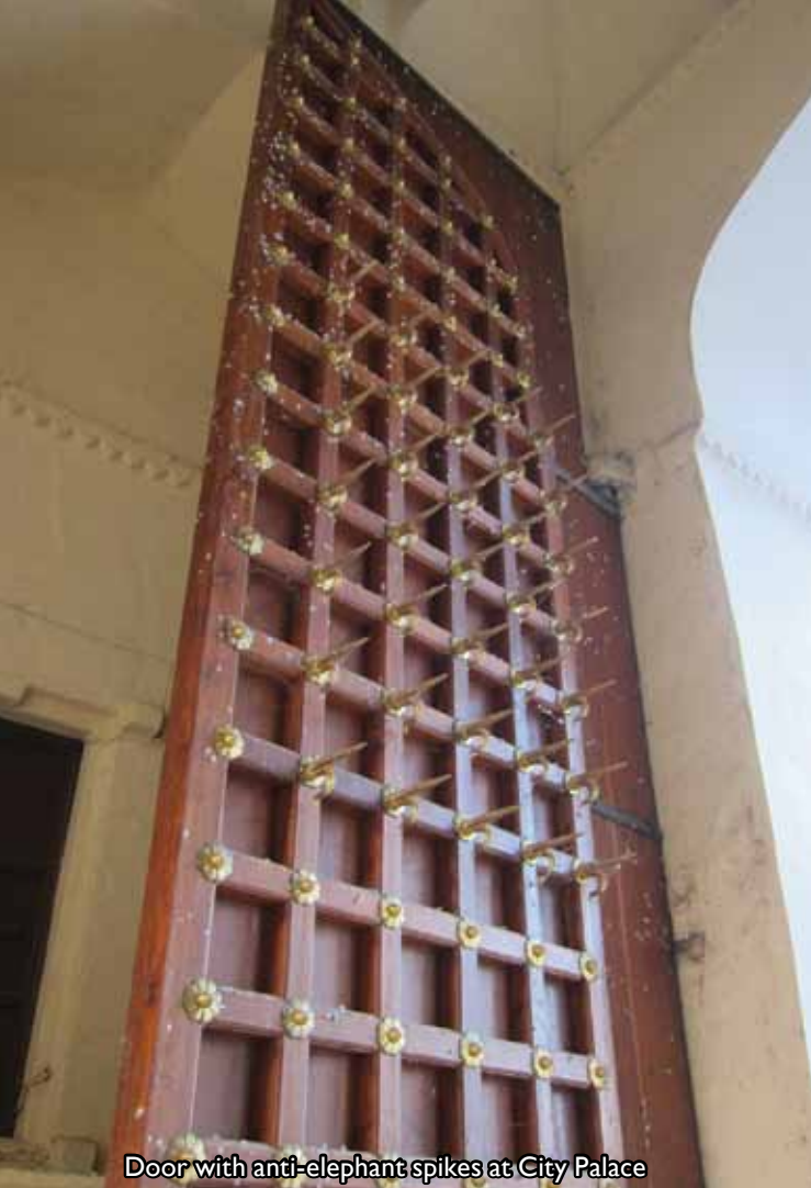
Door with anti-elephant spikes at City Palace